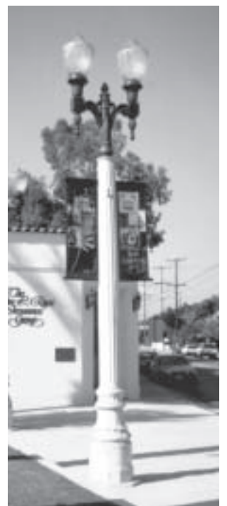
San Gabriel Style Tuff-Pole® with SCTW Twin-fixture Decorative Twin Arm and acorn luminaires