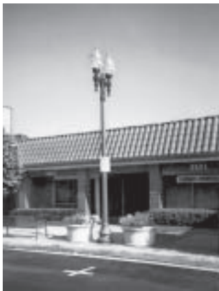
Washington Style pole with SCTW Twin-fixture Decorative Twin Arm and two acorn luminaires

These decorative arms look great with fluted or smooth shafts on Shakespeare Composite Structures™ D.C., San Gabriel, and Washington style Tuff-Poles®.