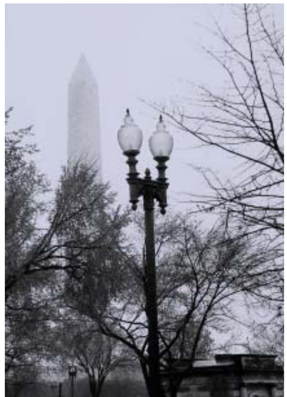
Washington, DC, historic district: Shakespeare Composite Structures™ D.C. Style Tuff-Pole® with DCTW Twin-fixture Decorative arm and Shakespeare's Style FAA composite luminaires.

Standard 3" x 3" dia. aluminum tenons for luminaire mounting